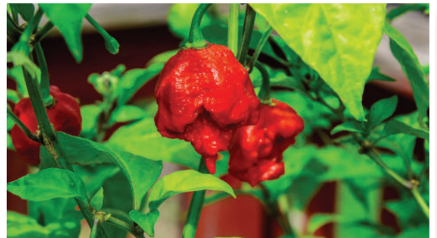
Sweet and hot pepper plants have arrived in our stores. Plant them soon!