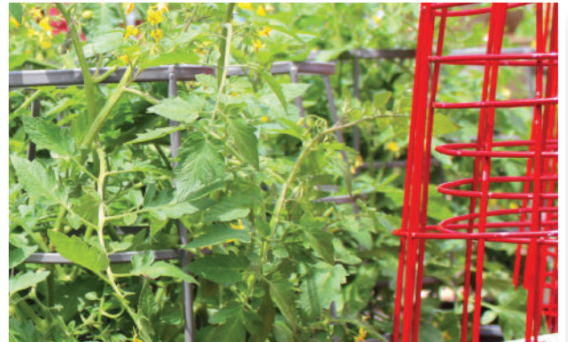
Get your tomato and pepper plants caged at planting time or right after. Once plants get large, it'll be too late!