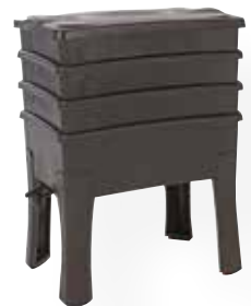
The Worm Café produces compost tea that keeps plants lush

Back by popular demand! Worms are Earth's unique natural recyclers. By putting them to work in a worm bin you'll convert household food waste into nutrient rich, organic fertilizer and worm tea that plants love. We have two worm bin options for spring: the Worm Café is a simple and sleek bin for small spaces, like apartment balconies and patios. The Can-O-Worms is ideal for small to medium households. These bins have hinged lids to make it easy to feed worms and a non-drip spigot to collect worm tea fertilizer. Both are made from 100% recycled material. Sloat Garden Center also carries Tip Top red wiggler worms, the species best suited for composting.