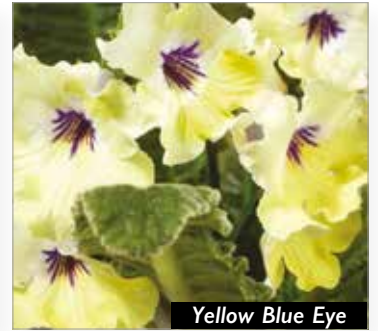
Yellow Blue Eye