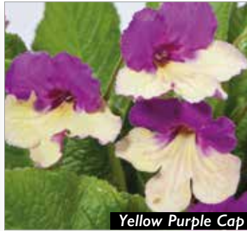
Yellow Purple Cap