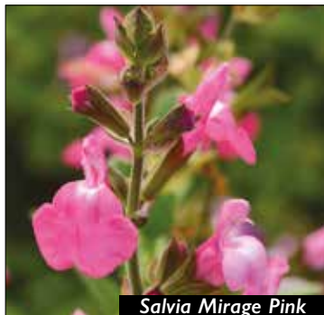
Salvia Mirage Pink

These beautiful, long blooming and low-maintenance perennials love sun and produce dozens of petite, colorful flowers that attract beneficial insects and hummingbirds all season.