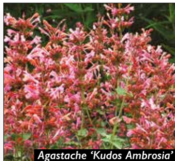
Agastache 'Kudos Ambrosia'

Gold flowers in large compact spikes start blooming in late May and continue through the season. If they look tired, just shear the plants back and they'll continue blooming all season.