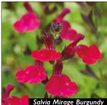
Salvia Mirage Burgundy