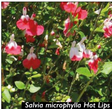
Salvia microphylla Hot Lips

The Salvia Mirage series is a compact salvia that grows 1-2' high and wide. It starts blooming early and goes through fall. Very heat tolerant in a full range of intense flower colors: pink, burgundy and (not-pictured) rose neon and deep purple.