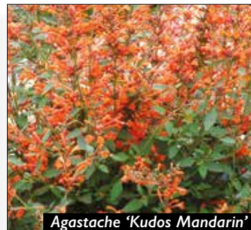
Agastache 'Kudos Mandarin'

Amazingly free flowering and easy to grow. Kudos 'Coral' has an impeccable habit. Long lasting, glowing, warm, coral colored plumes have a sweet honey-mint scent.