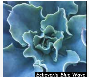
Echeveria Blue Wave

This beautiful, tall succulent has rosettes of dark, reddish-bronze leaves on stems up to 3 to 4 feet tall with emerging green leaves that give the rosette a green eye. Greener in part-sun.