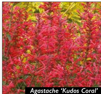
Agastache 'Kudos Coral'

Creamy coconut, pale orange and light rose pink spikes are charming and airy in containers or mass plantings. Flower colors change constantly, blending with almost any other color.