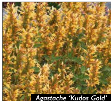
Agastache 'Kudos Gold'

Join us: Butterfly Wing Ding May 12 - 18