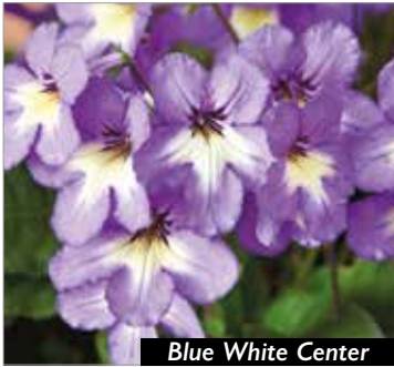
Blue White Center

Streptocarpus are African violet relatives known for their trumpet shaped flowers which bloom for months on end. Easy color for indoor spaces, or on a patio. Prefers bright, indirect light. We're carrying the dazzling Ladyfingers collection.