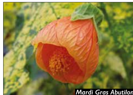
Mardi Gras Abutilon

Nice repeating combination of deep red and yellow/apricot pendant flowers held on long, wiry peduncles. Excellent as a staked, trellised, or hanging basket plant. Grows 6' to 10'.