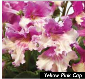
Yellow Pink Cap