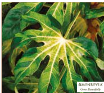
Camouflage Japanese Aralia

A perennial with two-toned foliage and huge clusters of vivid scarlet-orange blooms that are adored by hummingbirds. Compact and clump forming, it thrives in the landscape or patio containers. Stunning in cut-flower arrangements. Grown by Horticultural Craftsmen.