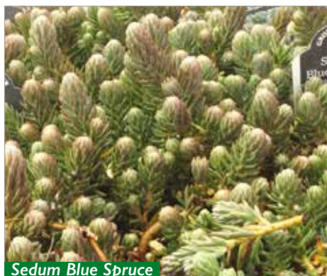
Sedum Blue Spruce

A low growing plant with purplish bronze leaves that bear dark-red blooms on trailing stems. Spreads to 2ft +. In summer, pink flowers appear in dense clusters at ends of 4-5 inch stems. Attracts butterflies and beneficials.