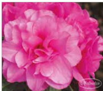
Azalea 'Happy Days'

Happy Days is a prolific, blooming, evergreen shrub with large clusters of double violet flowers that appear in mid-spring. Grows 3-5' tall by 4-6' wide.