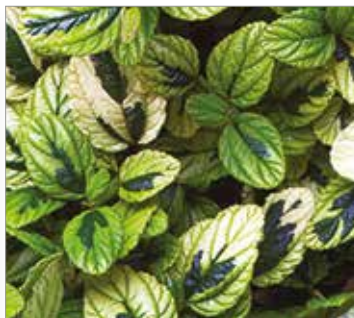
Ceanothus 'Diamond Heights'

This colorful evergreen shrub forms a compact mound of cream-and-green variegated foliage about 2-3' high and wide. In spring, brilliant magenta trumpet-shaped flowers bloom. Good for containers / small spaces. Attracts butterflies!