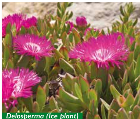
Delosperma (Ice plant)

Features upright stems clothed in gray-green leaves. Dense dome-shaped flower clusters appear atop stems. Their long lasting floral display begins late summer to fall; blossoms open purplish pink, age to brownish maroon.