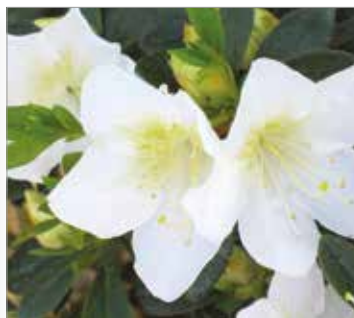
Azalea 'White Lace'

This heat-tolerant southern indica hybrid bears trumpet shaped orange-red flowers with red speckled throats from early-to-mid spring. Grows 3-4' high and wide.