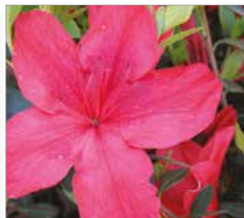
Azalea 'Orange Delight'

Happy Days is a prolific, blooming, evergreen shrub with large clusters of double violet flowers that appear in mid-spring. Grows 3-5' tall by 4-6' wide.