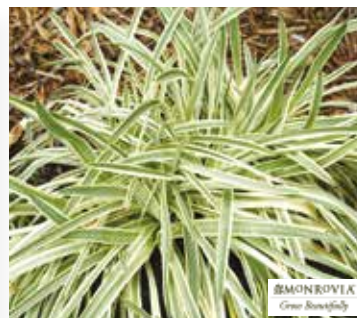
Liriope spicata 'Silver Dragon'

Tiny evergreen leaves with broadly variegated creamy-white edges. Sturdy, arching branches bear clusters of tiny, intensely scented flowers, exuding a white chocolate-like fragrance. This is an outstanding small tree, effortless espalier, or container specimen. Grown by Horticultural Craftsmen.