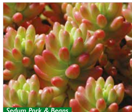
Sedum Pork & Beans

This CA native has bright blue-gray leaves packed into rosettes on short trailing stems. Light yellow clusters of flowers bloom in spring & summer. Very drought-tolerant.