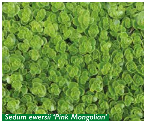
Sedum ewersii 'Pink Mongolian'

Succulents are garden workhorses, performing especially well as groundcovers, in rock gardens, and for draping over walls and containers. Soft and easily crushed, most succulents will not take kindly to foot traffic, but they are otherwise tough, low-maintenance plants that are interesting and fun to use throughout the garden. Once established, many will naturalize and not require much attention except for occasional summer watering. Sounds good to us!