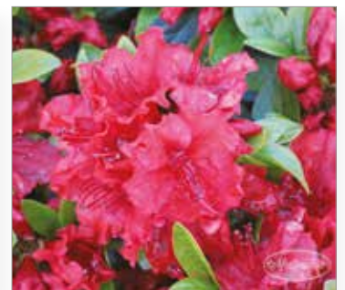
Azalea 'Girard Hot Shot'

White Lace is a heat-tolerant southern indica hybrid with trumpet shaped white flowers and light green speckled throats. Blooms early-to-mid spring and grows 4-6' high and wide.