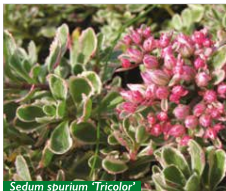
Sedum spurium 'Tricolor'

Leaves are covered with glistening dots that look like tiny ice crystals; features typical ice plant flowers with many narrow leaves. Blooms in late-spring or early winter and endures poor soil. The flowers form sheets of blooms that attract bees.