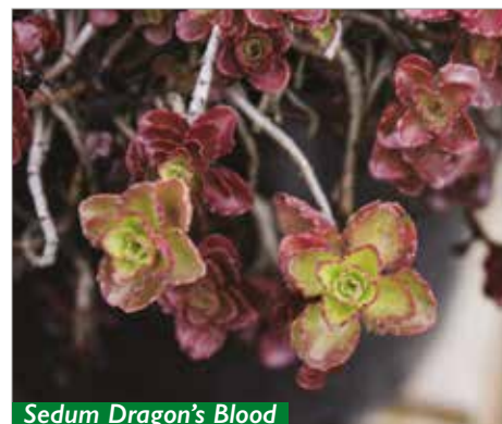
Sedum Dragon's Blood

This South African ice plant relative features trailing stems to 2 ft. long, profusely set with inch-wide, heart-shaped or oval, fleshy bright green leaves. Its bright red flowers bloom in spring and summer.