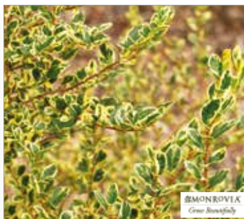
Variegated Box Leaf Azara

This handsome shrub illuminates the dappled shade garden with its colorful blend of yellow, lime and deep-green, highly textured foliage. Stays evergreen and very often will bloom from fall to winter, producing showy panicles of white flower clusters. Grown by Horticultural Craftsmen.