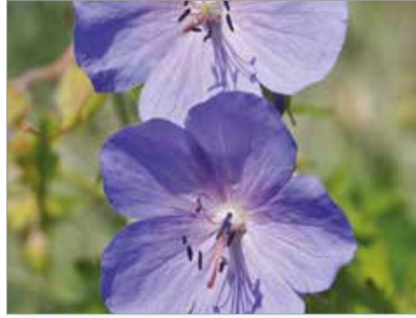
'Johnson's Blue' Geranium

This robust ground cover produces masses of large magenta flowers with purple veins in spring through late summer. Lends a soft edge accent to perennial areas, container plantings and rock gardens.