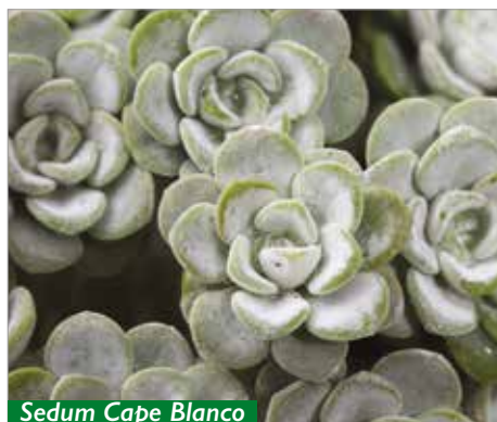
Sedum Cape Blanco

A spreading, creeping, drought-tolerant plant. Features narrow light blue-gray leaves that look like needles, closely set on stems. Yellow flowers in summer. Very vigorous.