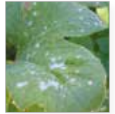
Powdery Mildew

After the winter rains have ended, many plant diseases can proliferate on vegetables, flowers, trees, shrubs and potted plants. One of the most common is powdery mildew; a plant fungus that appears on leaves as white spots or a coating resembling a white/gray dust. To combat it we recommend good air circulation around plants, gardening in quality soil, and using Monterey Complete Disease Control . This OMRI listed product provides broad preventative control of fungal and bacterial diseases in foliage and soil. When applied or sprayed, the beneficial bacteria releases enzymes that attach and break down the cell walls and membranes of harmful fungus, thus killing them. Then, the bacteria continues to colonize and protect in the soil and on the leaf surface. Monterey Complete Disease Control is safe to use around honeybees, earthworms, natural predators, and pets.