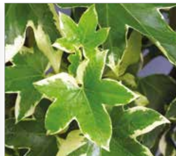
Fatsyhedera 'Angyo Star'

This drought-tolerant evergreen shrub forms a low mound of brilliant chartreuse-and-green foliage 1' tall by 5' wide. In spring, pale blue flowers bloom. Thrives with a little afternoon shade in hot climates. A wonderful container plant!