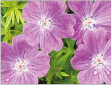
'Vision Violet' Geranium

Need a hardy, low-maintenance, flowering plant that can be planted almost anywhere? Try true geraniums; they'll grow happily in rock gardens, perennial borders, containers, and as groundcovers. Compact and able to spread quickly, true geraniums bloom over a long period of time, bearing show-stopping flowers and foliage. They do prefer some shade, especially in the East Bay. Grow in moist, well-drained soil.