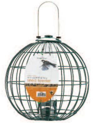
Metal seed feeder with squirrel blocking cage Easy access for filling.