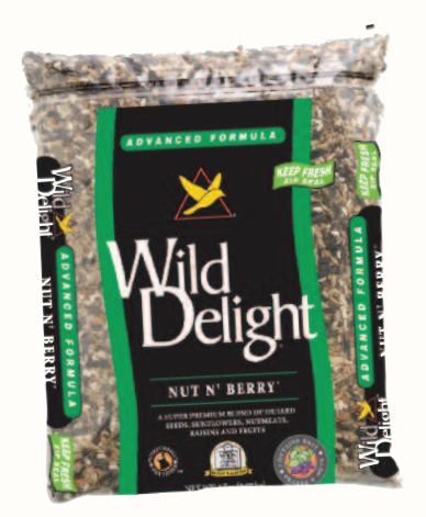
Nut N' Berry: a premium wild bird food blend of hulled seeds, sunflowers, nutmeats, raisins and fruits to attract and feed all seed eating birds.

Bird feeding tips: Keep feeders full. Keep clean and make sure fresh water is available. Feed birds all year long to ensure their return.