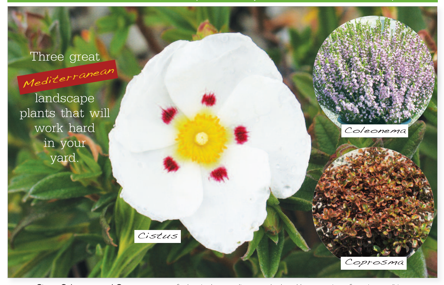
Cistus, Coleonema and Coprosma are perfectly suited to our climate and adaptable to a variety of growing conditions.

Cistus is also known as Rockrose; it's a terrific, carefree shrub that bears a profusion of showy flowers from spring into early summer. Soft green, silver or gray foliage will add subtle color and texture to your garden. Single flowers have contrasting centers or petals marked at the base. Cistus is fragrant on warm days and are worth planting for this feature alone.