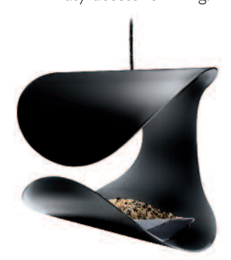
Contemporary metal flythrough seed feeder finished in metallic jet black,

All styles are not represented at all stores. Call ahead for specific items.