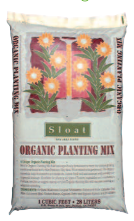
Sloat Organic Planting Mix 100% organic, our Planting Mix promotes drainage, air and water penetration, and loosens clay soil.