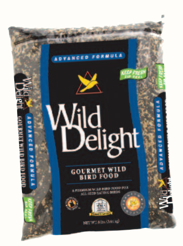
Gourmet Wild Bird Food: a premium wild bird food for all seed eating birds.

Food for Songbirds, Woodpeckers, Cardinals, Finches, Titmice, Jays, Grosbeaks, Buntings, Nuthatches and Chickadees.