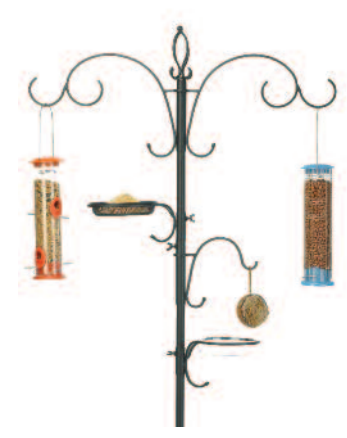
97" Dining Station with two-way head and ground spike. Kit includes feeding tray, water dish and additional hook.