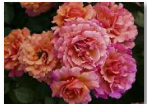
Easy Does it

Bloom / Size: Large, double, informal Fragrance: Strong sweet spice & fruit Comments: A fragrant yellow bloom