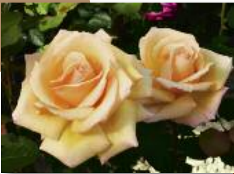
Over the Moon

Bloom / Size: Medium-large, double, ruffled Fragrance: Moderate fruity Comments: Perfect in every climate