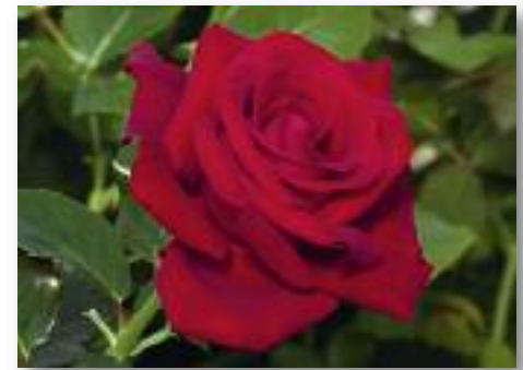
Drop Dead Red

Bloom / Size: Medium, in large clusters Fragrance: Moderate fruity Comments: Appreciates a little afternoon shade.